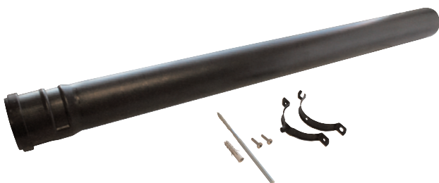
1 metre extension