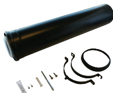
External 600mm 80/125 flue extension